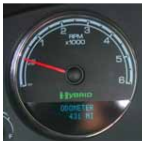
Tachometer with Auto Stop Indicator

A tachometer with Auto Stop indicator and an Economy gauge are unique to these vehicles